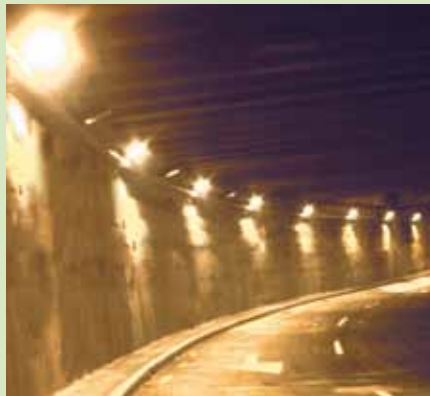
Subways - Verona