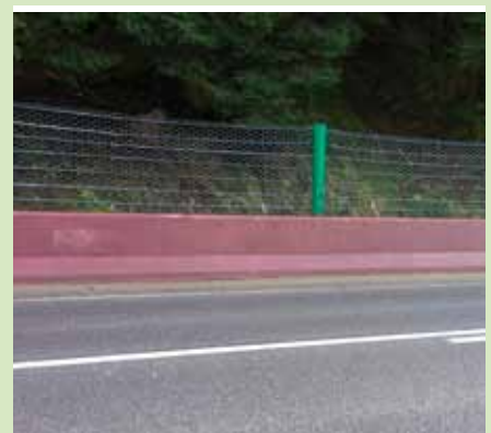
New Jersey - Val d'Ega