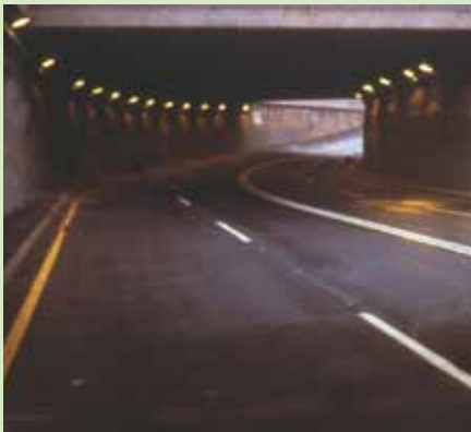
Subways - Verona